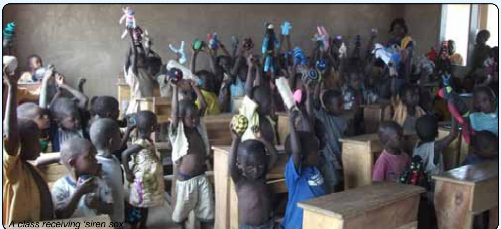
A class receiving 'siren sox'