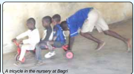
A tricycle in the nursery at Bagri