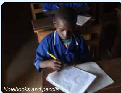
Notebooks and pencils

Our supporters will also be interested to see a tricycle in use in the nursery in Bagri - purchased from the proceeds of a brunch in the Luton area.